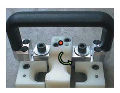
Firgure 3: Center of Gravity Rotational Direction During Use