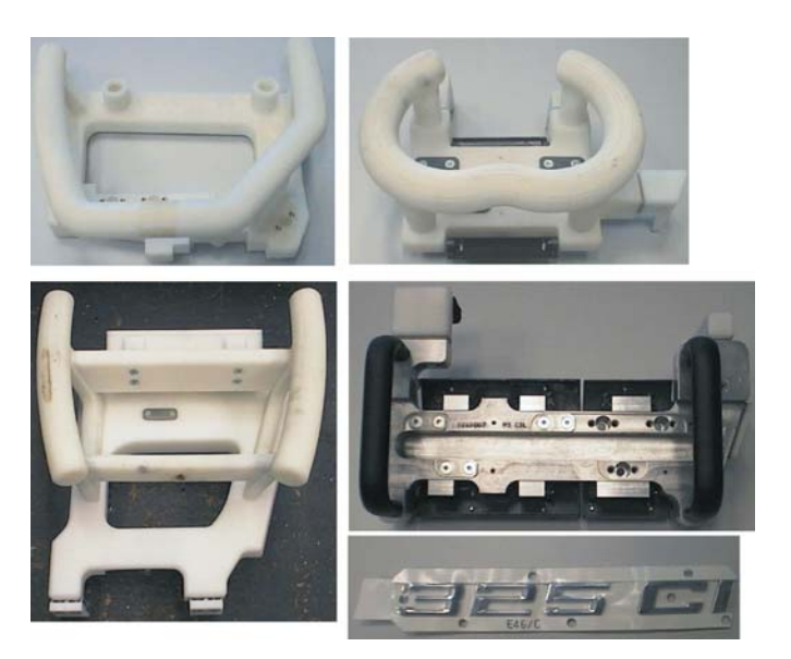
Figure 4: Four devices for attaching the model badge at the rear of the vehicle

FDM production tools lend themselves particularly well to hand-operated devices. It is important, for instance, that a device is easy to handle and comfortable to grasp for the user. This is particularly important when the device is frequently used, as is the case for the assembly-line production of vehicles. For example, the geometry of the grip influences the ergonomics of a device.