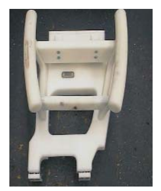
Figure 4: Complex and Organic Shape of a Production Tool

Figure 4 shows the prototype of a device for mounting a support for attaching bumpers. The device was manufactured from aluminum, polyamide, and FDM parts using a mixedcomponent method of construction. The tubes contain wire ropes that extend and retract magnets via a lever. The production of the tubes does not represent a problem for the FDM system, due to the manufacturing process. The tubes were attached to a rib to stabilize the magnets.