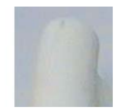
Figure 2: Position of Center of Gravity of the Striker Gauge

Using a basic FDM body and grip with grid construction could be the solution. Additionally, the grip would have to be in the shape of an arc whose two ends reach the recesses for the electric screwdriver. This would result in a balanced device and, therefore, more ergonomic handling.